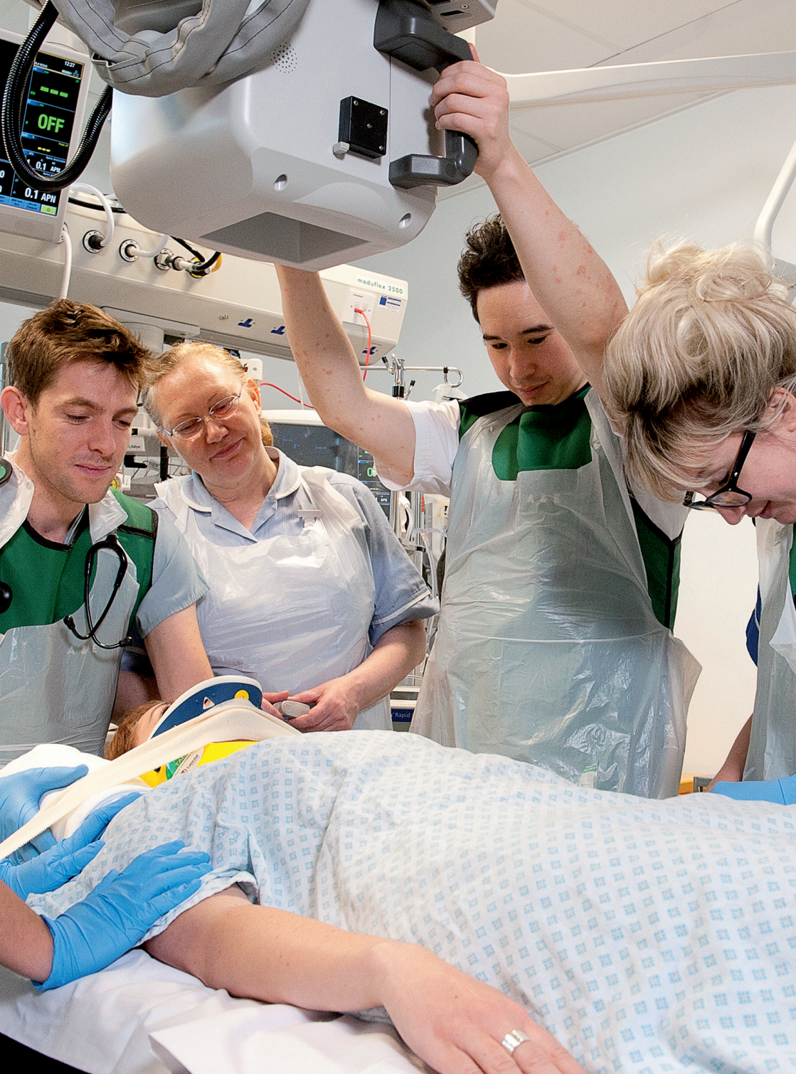
Radiographers Speech and language therapists