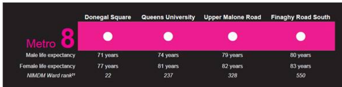
Figure 12. Life expectancy 20 at selected points along a Belfast Metro line (2006-08).